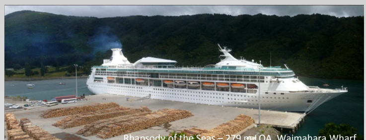
Rhapsody of the Seas – 279 m LOA. Waimahara Wharf