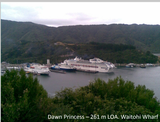
Dawn Princess – 261 m LOA. Waitohi Wharf