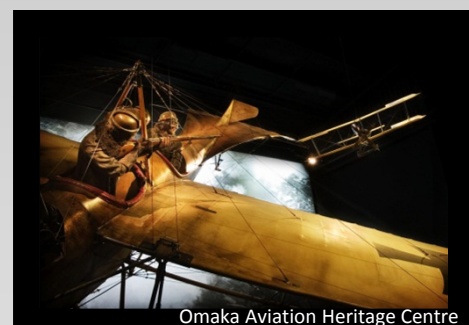
Omaka Aviation Heritage Centre

In addition, neighbouring attractions of Nelson and Kaikoura are both only a 2 hours drive away.